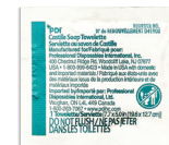
PDI Castile Soap Towelettes