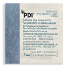
PDI Adhesive Tape Remover Pads