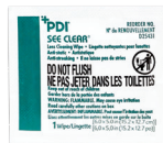
PDI See Clear Lens Cleaning Wipes